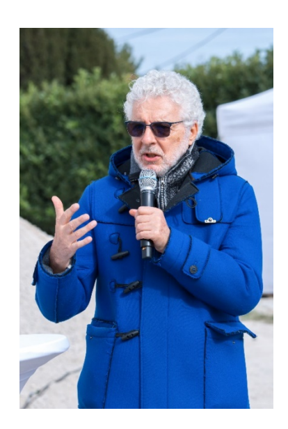
André Heller