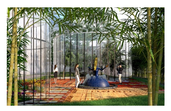
Greeting from Morocco © Büro André Heller