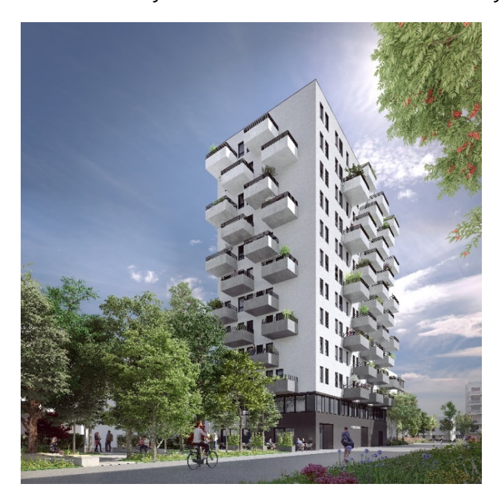
Building 5